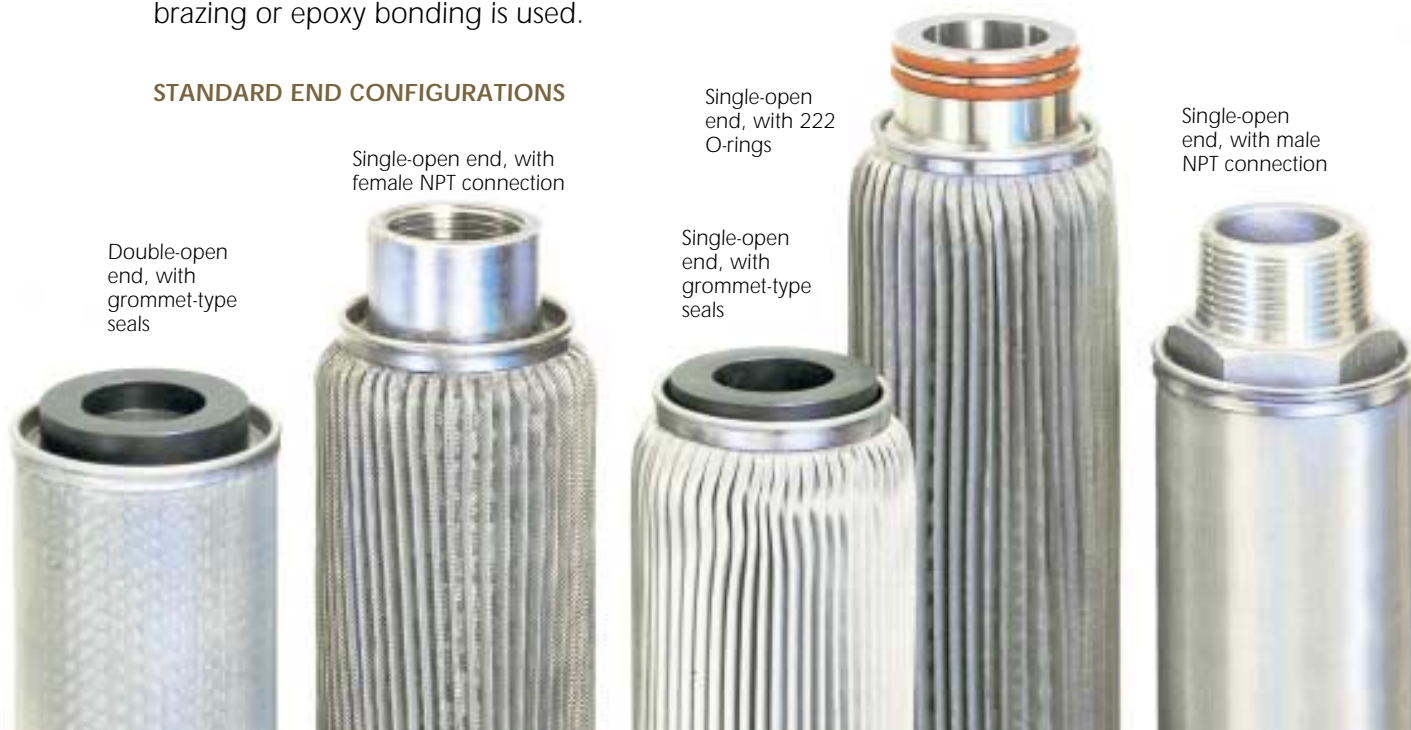
Double-open end, with grommet-type seals